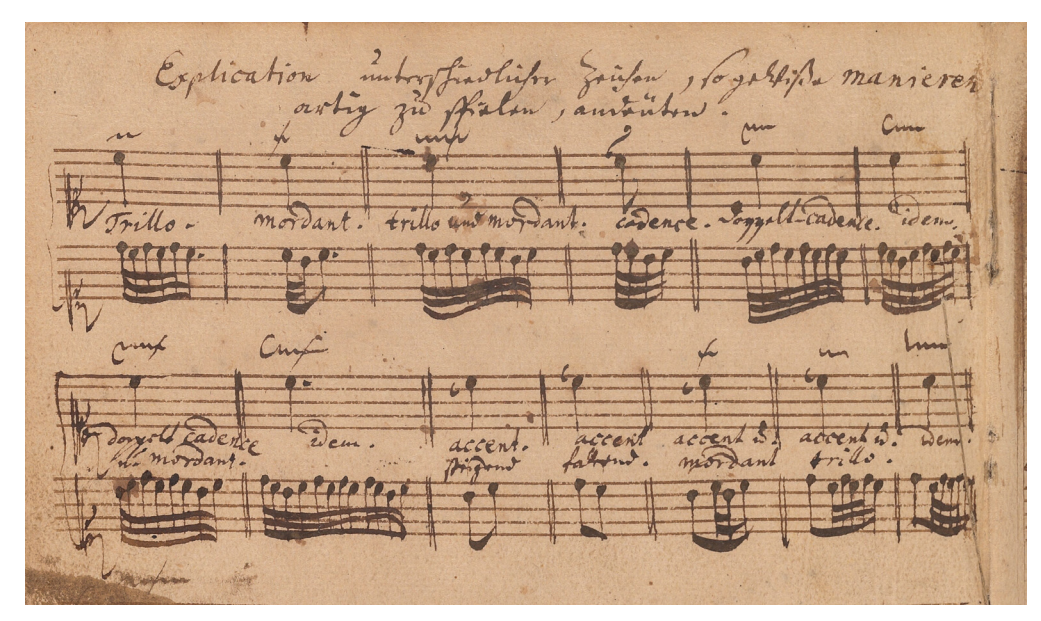
Figure 1: Johann Sebastian Bach, ornament table in the Clavierbüchlein vor Wilhelm Friedemann Bach , begun in 1720. Beinecke Rare Book and Manuscript Library, Yale University.

The first step in this demystification is to compare Bach's ornament table with others compiled by his contemporaries, examples of which can be distributed to the class at this point.<sup>6</sup> Bach's was one of dozens of similar tables produced in the late seventeenth and early eighteenth centuries. The fact that the majority of these were assembled by French composers provides modern-day students with a window onto the cultural influences on the German high baroque, and