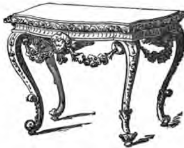
Figure 2. A table in the Louis XV style, like those in Robert-Houdin's shows.