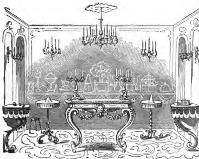
Figure 3. Robert Houdin's "salon": the theatre at the Palais-Royal.