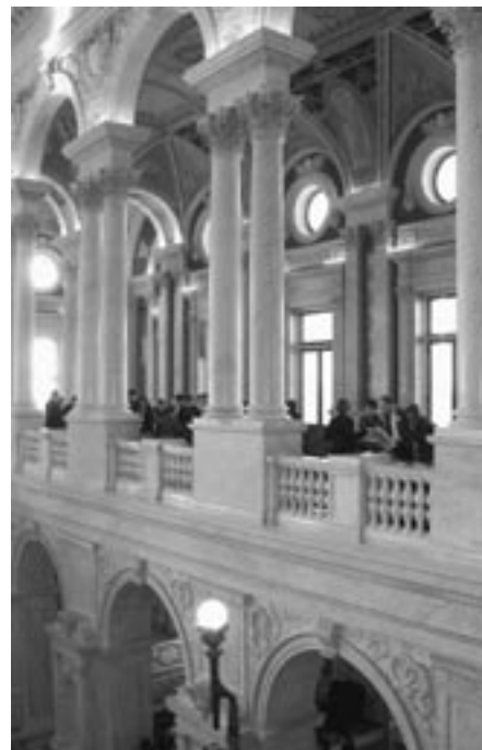
AMS meeting attendees tour the Great Hall, Library of Congress