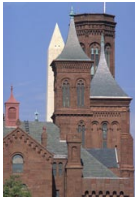
The spires of the Smithsonian Institute