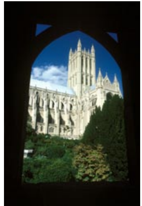
The National Cathedral, Washington, D.C.

Area universities and performing groups also