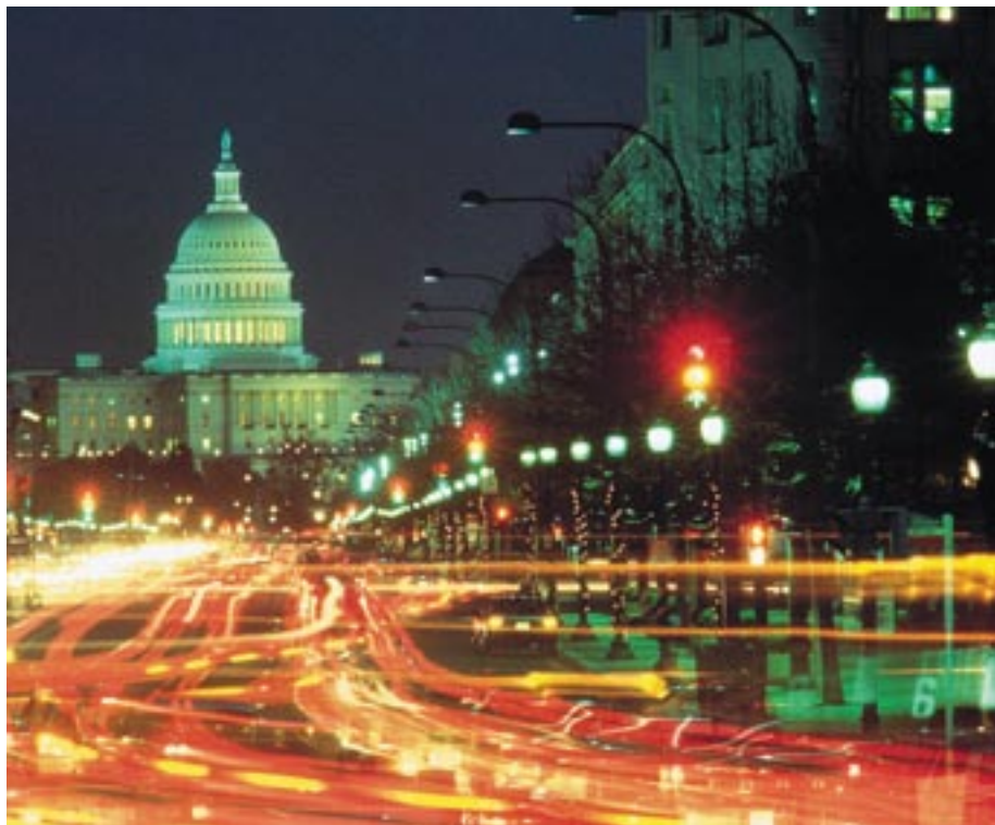
Washington, D.C.: The U.S. Capitol at night